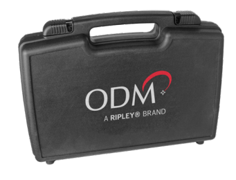
VIS 400 unit comes with 4 standard inspection tips and cleaning kit in a hard carry case.