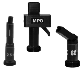
Interchangeable adapter tips provide inspection of many different connector types.

ODM's inSpec<sup>®</sup> software provides automated PASS/FAIL analysis of connector endfaces to meet international standards.