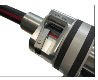
A self-feeding design reduces operator fatigue.