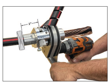
Engineered with enhanced safety features.