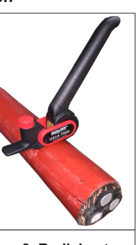
3. Radial cut