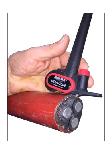
1. Set the blade depth