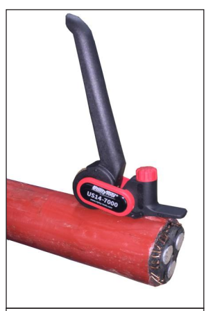
2. Longitudinal cut