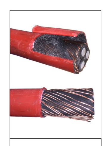
4. Remove sheathing